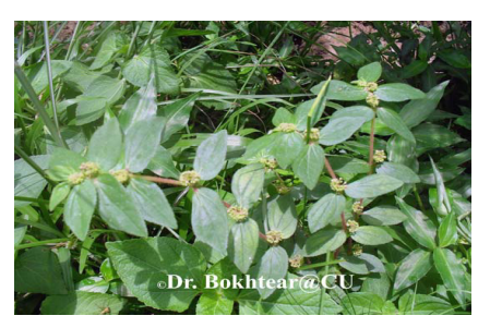
Figure - 1: Morphology of Borreria hispida(Linn) .

prevention of many diseases <sup>[5]</sup>. Among the different plant derivatives, secondary metabolites proved to be the most important group of compounds that showed wide range of antioxidant, antibacterial and antifungal activity <sup>[9-10]</sup>. Many more compounds have high rich sources of polyphenol present in plants, foods, and beverages, soluble in water and polar organic solvents. These hydroalcoholic leaf extrcat are classified as soxhlet method and its following condensation based on their biological activity <sup>[11-12]</sup>.